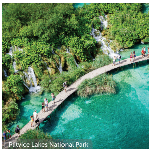
Plitvice Lakes National Park